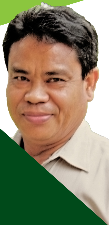
Efren Miranda Conference Bishop

Department of International Missions acgc.us imissions@acgc.us