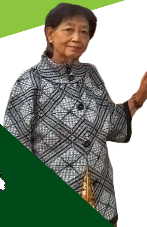
Christian Mission Ban Naratchakwai

Department of International Missions acgc.us imissions@acgc.us